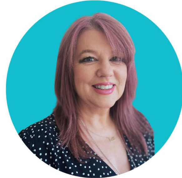
Evelyn Murray Social Enterprise, Craft and Events