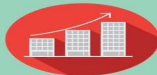
COMMERCIAL YIELDS ON NON-DOMESTIC PROPERTY