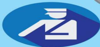
PERCEPTION OF SAFETY & OCCURRENCE OF CRIME