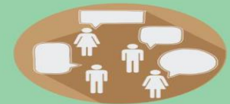
CUSTOMER VIEWS & BEHAVIOUR