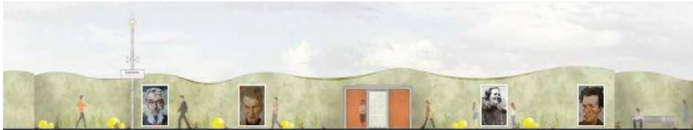
Proposal showing part of the western platform. 150