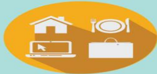
DIVERSITY OF USES