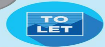
PROPORTION OF VACANT STREET LEVEL PROPERTY