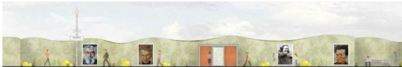
Proposal showing part of the western platform. 150